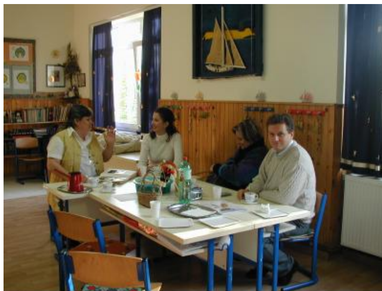
Figure 2. A meeting of teacher action researchers