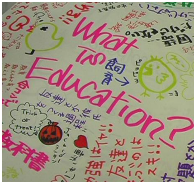
Video 1. Having fun with portfolio evidence (Adler-Collins, 2008)