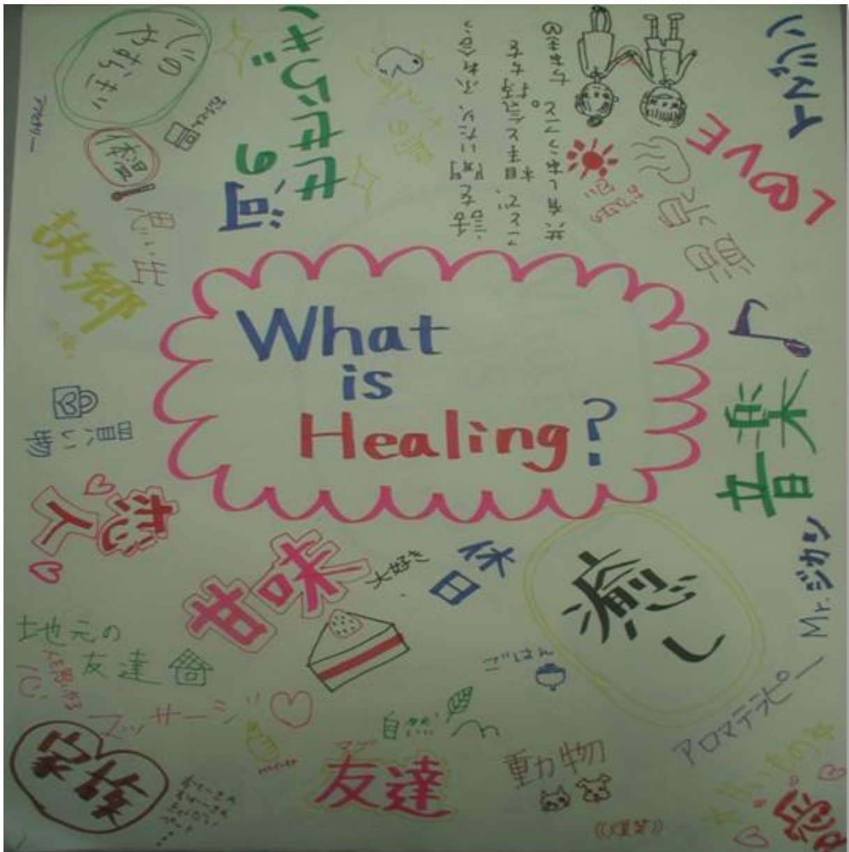
Figure 7. A students' group portfolio: What is healing?