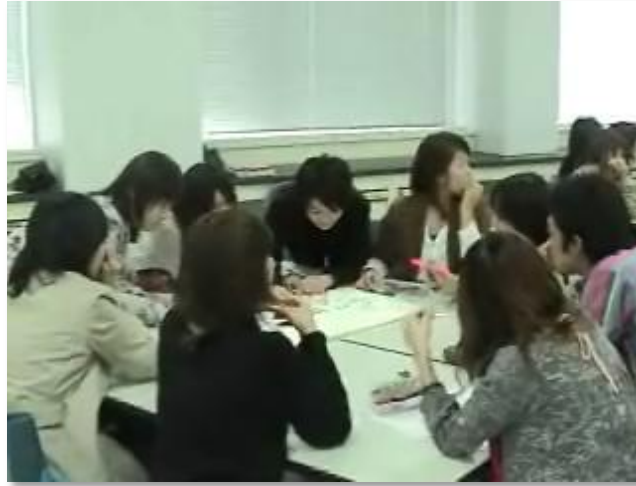
Figure 4. Students in Group work (Healing Theory)

For me, this picture (Figure 4) which at first may look unassuming, suggests the starting of a new group-dynamic. The students appear to be focused and looking inward. Their body language is leaning towards the focus on the portfolio at the centre of the group. Three students are actively writing.