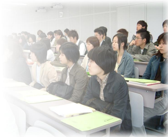
Figure 1. Normal classroom layout in the university (2004) 6

The above photograph is typical of the university lecture-setting, being highly formal, and the body-language of the students shows the power-issues of the sensei 7 /banking educator at work. This is an example of Hall's (1969) fixed feature space.