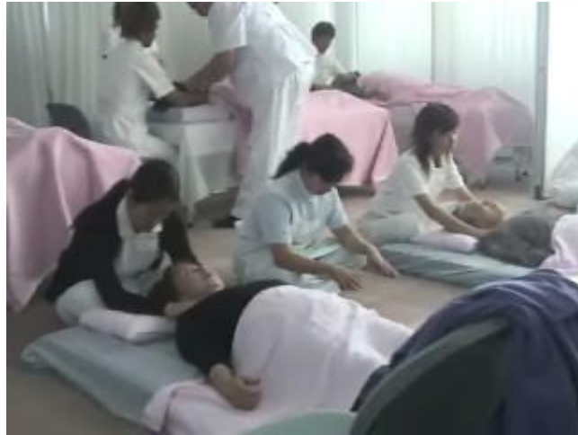
Figure 8. Pictures of body language and touch from classroom healing activities.