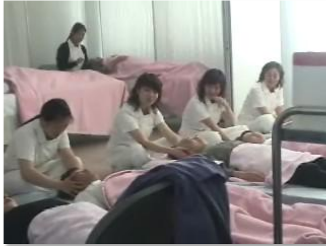
Figure 10. Understanding Compassion