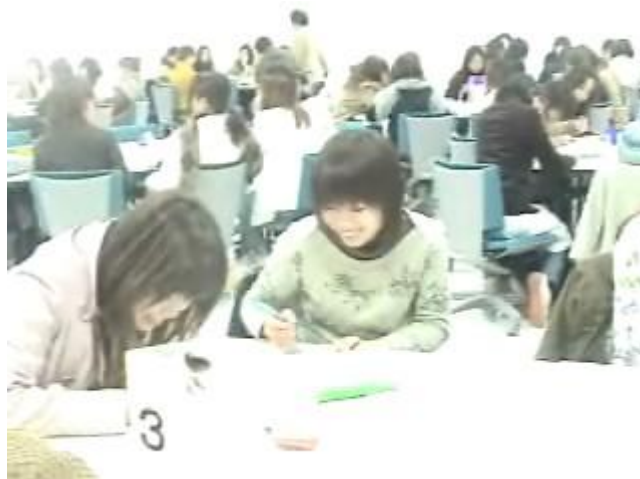
Figure 5. Students in Group work (Healing Theory)

For me, this picture (Figure 4) which at first may look unassuming, suggests the starting of a new group-dynamic. The students appear to be focused and looking inward. Their body language is leaning towards the focus on the portfolio at the centre of the group. Three students are actively writing.