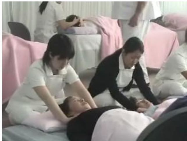
Figure 9. Healing Touch

Individual student's evaluative reflections: