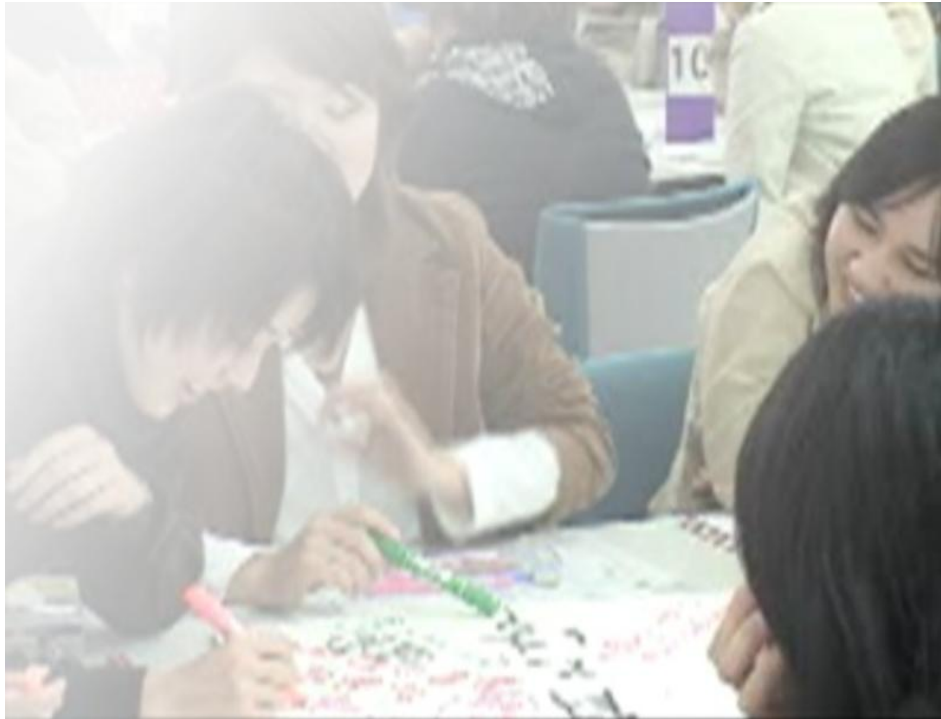
Figure 2. Layout of healing theory classroom after we had negotiated the classroom formation and layout (2003)