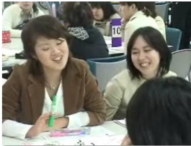
Figure 3. Students engaged in Portfolio Building (2003)