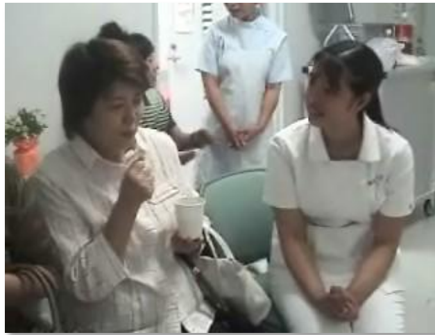
Figure 12. Communications skills with patients