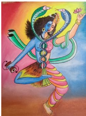
Figure 2. Photo painted by my friend: Ardhanarishwar as the metaphor of my living-educational-theory methodology

space from which to embrace emergent context-responsive approaches, to integrate and to have a harmonious interplay between multiple approaches which results in “methodological inventiveness”.