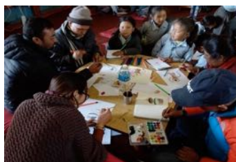
Image 1. Photograph of my students, teachers and a local artist

Knowing the aesthetic value of arts and respecting teachers’ best practices and with their willingness, we invited a local professional artist to the school to enhance learning arts together with the students in the school. We conducted a workshop for a week in which all the teachers, and the students from grades one to three, sat together and sketched and painted some local artefacts. All the participating teachers enjoyed this activity as all the teachers and students participated actively from the first day to the last day, sharing ideas, skills and laughter. This collaborative practice brought an arts-based, contextual local curriculum to Level 1.