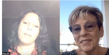
Video 5. Shared office (Dhungana, 2020e)

ample opportunity to participate in collaborative practices and reflect on my living value within the university setting before going into the field. Explaining the positive influence of the shared room and community of practices in my initial phase, I conversed with Jackie in the following video clip (10 th January, 2020).