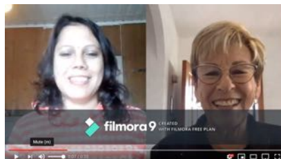
Video 2. Love as energy (Dhungana, 2020b) https://youtu.be/JGgzs7YnSZQ

The following video shows my value as a life-affirming energy that enhanced my research practices in the second Skype conversation with Jackie on 10 th January, 2020.